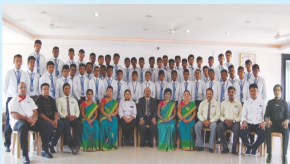
GIHM -PRINCIPAL, FACULTY WITH 1st YEAR 2nd sec BHMCT STUDENTS