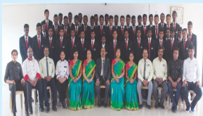
GIHM -PRINCIPAL, FACULTY WITH 3rd YEAR 2nd sec BHMCT STUDENTS