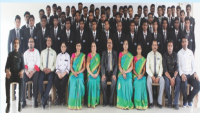
GIHM -PRINCIPAL, FACULTY WITH 2nd YEAR 1st sec BHMCT STUDENTS