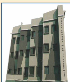
Global Academy of Hotel Management

Recognised by S.B.T.E.T. Eligibility : S.S.C. / Equivalent Duration : 1 Year