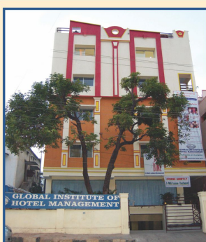
Global Institute of Hotel Management

# 3-4-519/1, Barkatpura, Hyderabad-500 027.