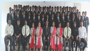
GIHM -PRINCIPAL, FACULTY WITH 2nd YEAR 2nd sec BHMCT STUDENTS