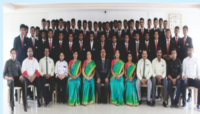
GIHM -PRINCIPAL, FACULTY WITH 3rd YEAR 1st sec BHMCT STUDENTS