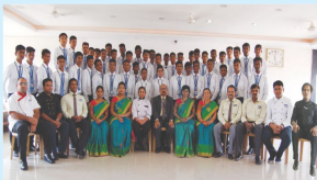
GIHM -PRINCIPAL, FACULTY WITH 1st YEAR 1st sec BHMCT STUDENTS