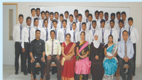
GIHM -PRINCIPAL, FACULTY WITH 1ST YEAR BHMCT STUDENTS